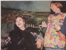
No topic is sacred when it comes to the comedy of House and Stapleton.