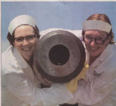
Be prepared for a blast at the upcoming tour One Unforgettable Night with Two Unforgettable Dames .